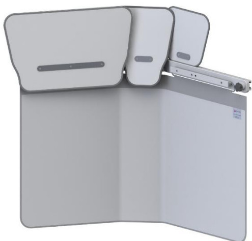
Lower body radiation shield – 312/E-020 (shown with three optional top shields)