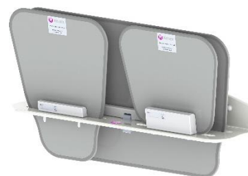
Wall rack – 312/W-TOP (tops not included)

Weights and dimensions are subject to manufacturing tolerance