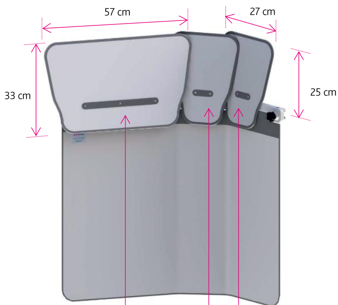
Optional top shield 312/DS/3.32 Weight: 2.1 kg