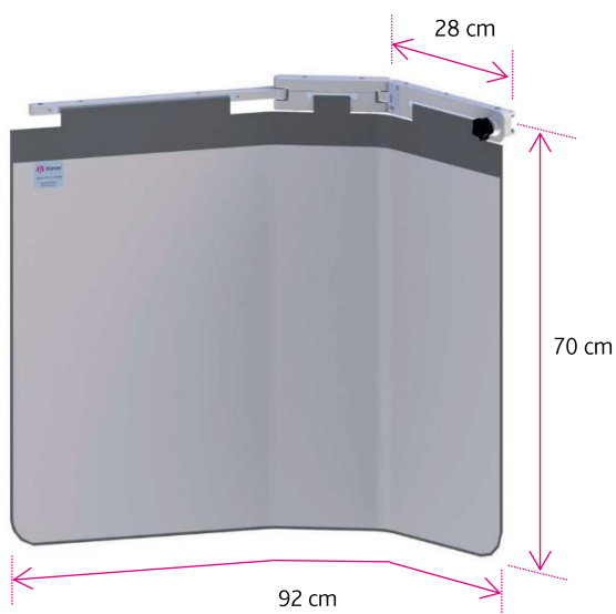
312/E-010 Weight: 7.2 kg