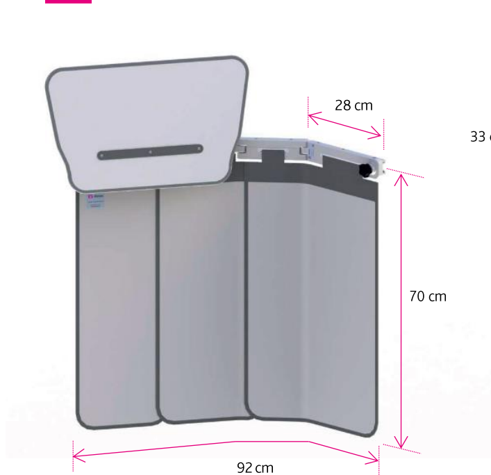
312/E-011/P Weight: 9.2 kg