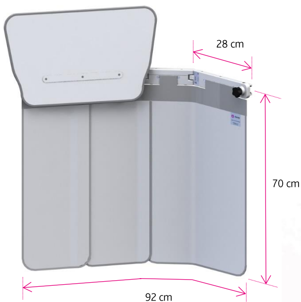
312/E-011/P Weight: 9.2 kg