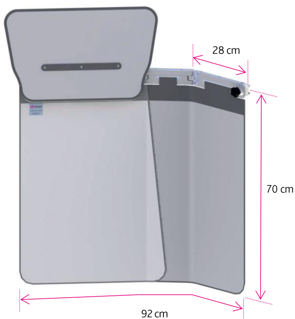
312/E-013 Weight: 12.8 kg