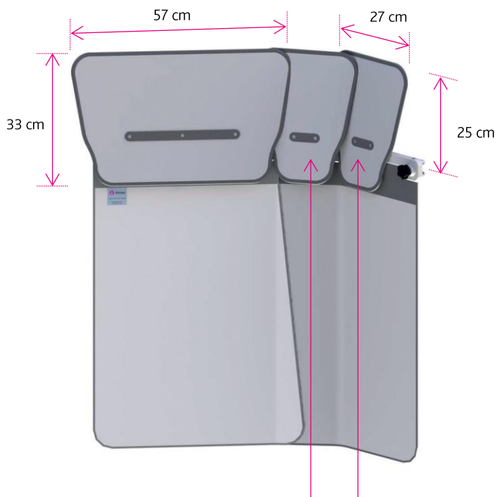
Optional top shield(s) 312/DS/3.30 Weight: 0.8 kg