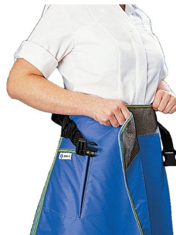
Model 919 Pocket 900/001 shown as an optional extra