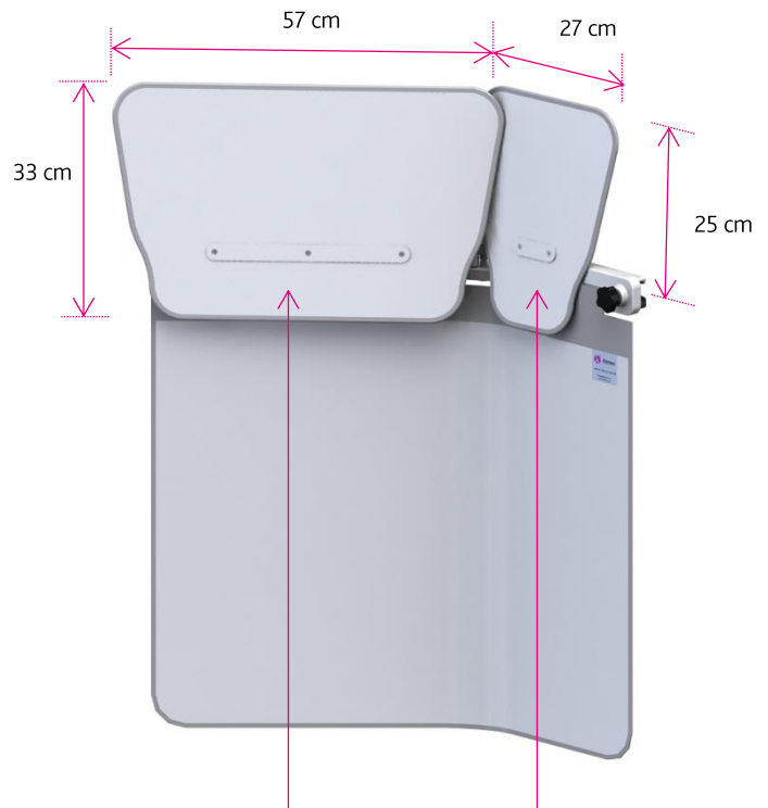
Optional top shield 312/DS/3.32 Weight: 2.2 kg