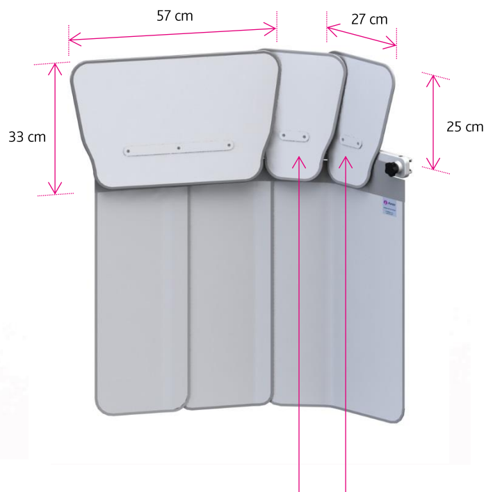
Optional top shield (s) 312/DS/3.30 Weight: 0.9 kg