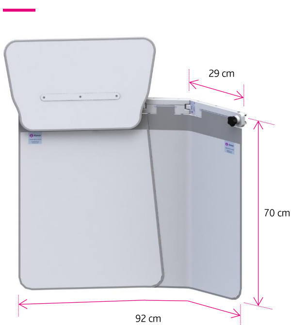
312/E-013 Weight: 10.3 kg

Weights and dimensions are subject to manufacturing tolerance